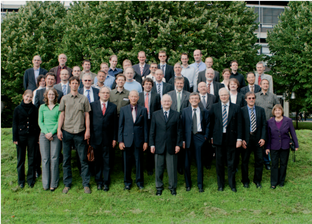
Fig. 1: ITO alumni at the 50th anniversary

The second session was opened by Dr. Totzeck of Carl Zeiss AG. He gave an outlook about the future of optical measurement systems. Dr. Reichelt (SeeReal Technologies) gave a presentation about future 3D display technologies and finally Dr. Windecker from the European Patent Office talked about the role of intellectual property in optics. Finally, the banquet was followed by a social get-together night.