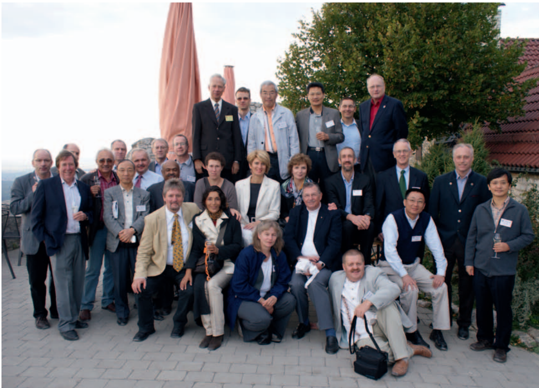
Fig. 1: The program committee of Fringe 2009